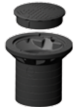
Tank shaft & cover

Order-No. RWDS0042 xxx.- £ incl. VAT xxx.- £ excl. VAT